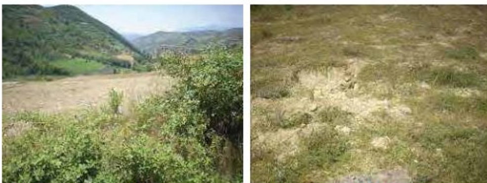
Photo7.0-1-The area where the construction and operation site can be built

Before reaching the spillway discharger, at the right side of the road, lays a land area of about 800-1000 m 2 , which has a low slope and can be used for construction site and the maneuvers of vehicles. This area (mostly leveling) may be augmented even more with little work. Based on the information provided by the municipality, this area is property of Otlake commune and it is state available property.