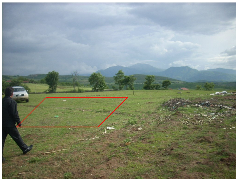
Foto. Sheshi ku mund te ndertohet kantieri, fshati Tregtan

Ne afersi te diges, ne krahun e djathte te rruges qe lidh rrugen e fshatit me digen e rezervuarit ndodhej nje sipërfaqe e lire, prone e komunes ku mund te ngrihet kantieri. Per ngritjen e tij ka nevojë per hapjen e nje rruge rreth 40 m te gjate. Vendi eshte i sheshte. Vlen te theksohet qe nuk ka probleme pronësie, per rjedhoje nuk ka nevojë per shpronësime ose marje toke me qera.